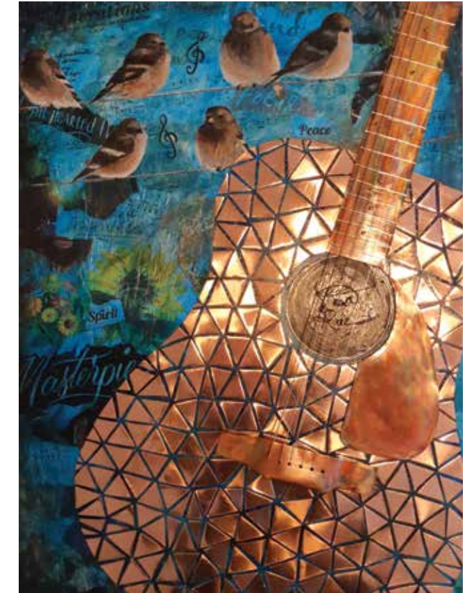
far left: Midnight Reflections top left: Springtime Melody bottom left: Robin Song above: Take These Wings and Fly

subtle words and images give more details and add interest. In all of my mixed-media artwork the metal pieces are individually cut by hand, then shaped and sometimes even torched to give each subject a unique and personalized quality that cannot be achieved in the same way by using a machine. Many pieces of my artwork also incorporate metal wiring that is woven into the image, and this allows me to capture more light, more angles, and more movement for each piece. Each piece of artwork is a labor of love. Because of the many layers of each painting and the intricate details, some pieces can take months to complete, but this allows me to fully embrace the idea I want to convey behind each painting.”