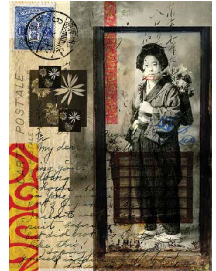
The Japanese Flower Girl

“I often incorporate into my works scraps of old documents, photographs, steel engraving photo transfers, flowers, and other flotsam, ephemera, and detritus of daily walks as I create imaginary landscapes, construct new narratives, or explore the medium’s sculptural and textural possibilities. I create paintings that explore the passage of time, transience, surface texture, space, and place.