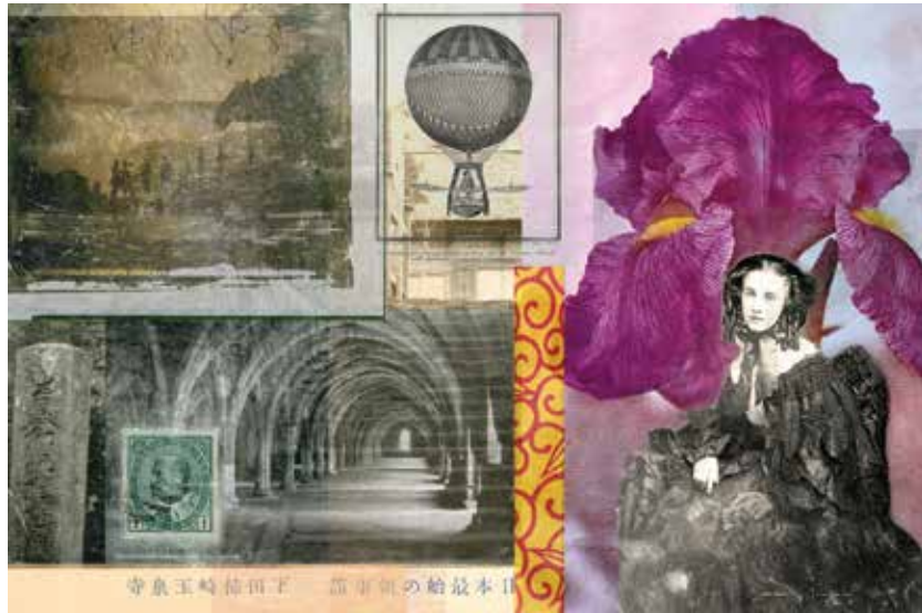
A Year Abroad

“My interest in digital collage and montage began decades ago with my exposure to the surreal photographic montage work of Jerry Uelsman, laboriously produced in his darkroom. Decades later, his wife, Maggie Taylor, developed her own unique style as a pioneer of Photoshop digital montage. The works of these outstanding artists and others inspired me to explore narrative photo collage.