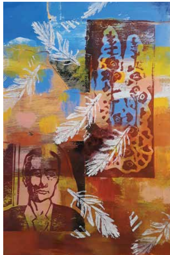
Remembering Georgia O'Keeffe